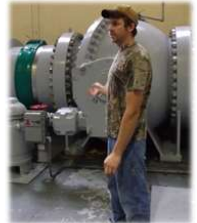
Tacoma Power Jake, Hydroelectric Utility Worker Centralia College