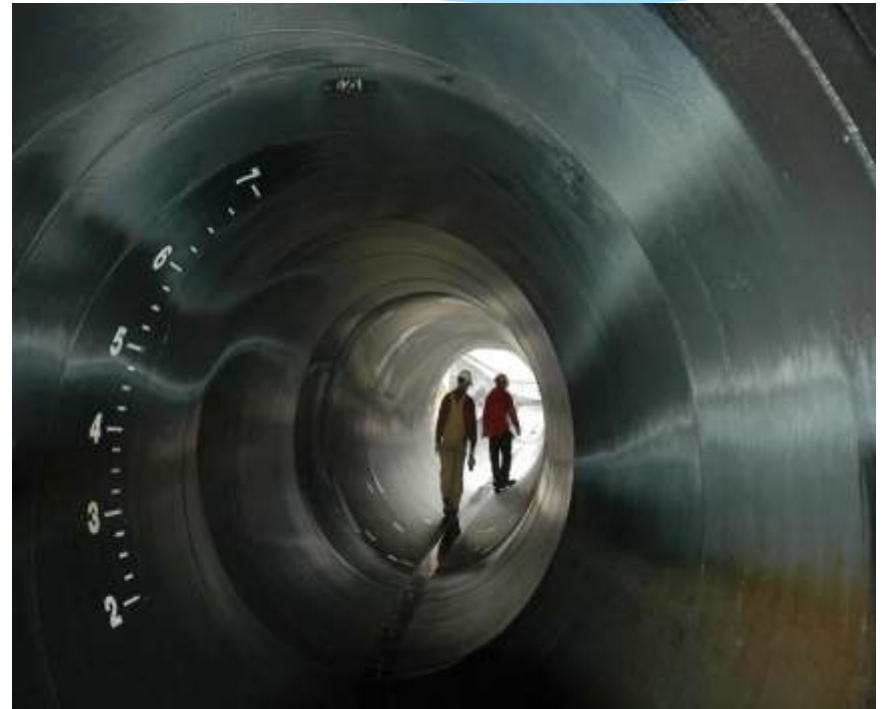
Maintenance employees walk through the juvenile fish bypass